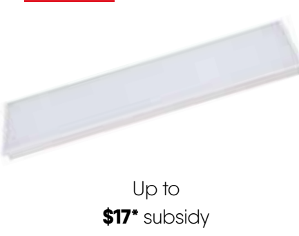
on each LED troffer