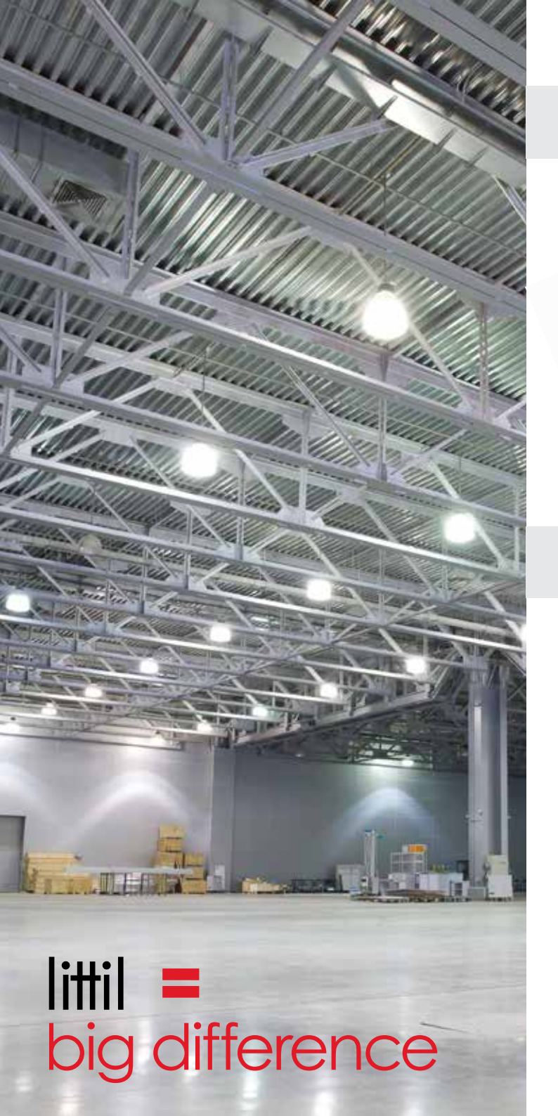
FORTIS IP65 LED Battens