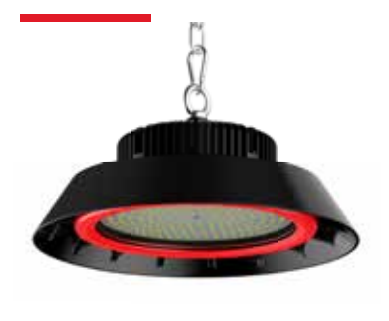
Up to $155* subsidy on each LED Highbay