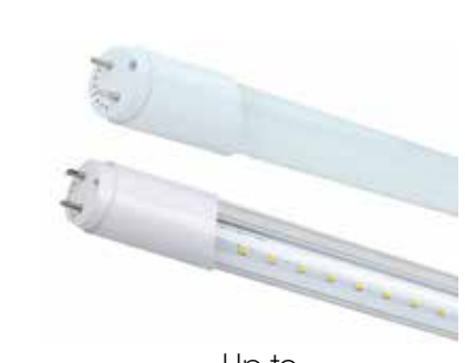
Up to $17* subsidy on each LED tube

*Discounts depend on VEEC value and quantity. Terms and conditions apply.