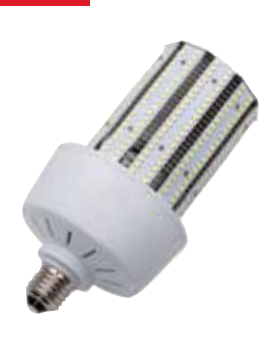
Up to $160* subsidy on each LED Corn